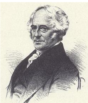
Thomas Hancock 1786 - 1865

Perhaps he was inspired by the ancient Aztecs, who used the sap from a local vine to transform rubber from something soft and squishy to hard and durable.