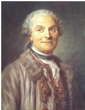
Charles de la Condamine 1701 - 1774

Despite having been introduced to the Europeans from the 15 th century, the practical and industrial applications of natural rubber were not forthcoming for some time. The first scientific paper on rubber was not written until 1751 by the French scientist Charles de la Condamine after he returned from his expedition in Peru. Over time many inventors and scientists began to experiment with rubber fabrics, rubber products and their applications.