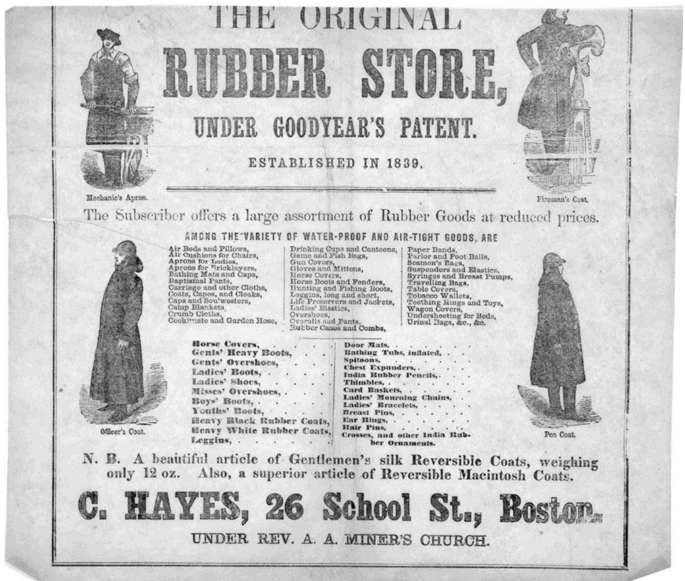
An advertisement showcasing the wide variety of rubber goods produced by Charles Goodyear following his discovery of vulcanisation

Many became exceedingly wealthy during this time. There is however, a fairly notable exception. Through a series of misfortunes and embroiled in patent disputes, Charles Goodyear never realised much profits from his revolutionary discovery and died a man of modest means. Nonetheless, the impact of his contribution was felt by his contemporaries. Decades after his death, a new company was founded in his name to honour his legacy and as such, the Goodyear name lives on.